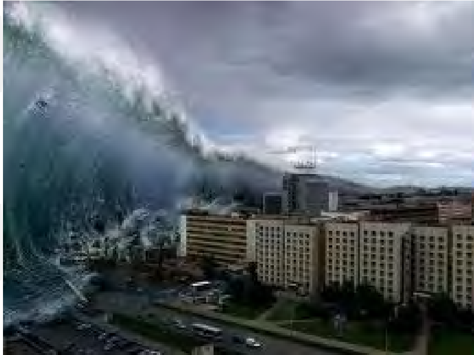
Artist Depiction of a Mega tsunami

In Haiti an earthquake has taken the lives of over 230,000. Injured 300,000 and left 1,000,000 homeless. Collapsed residences and buildings and even now, almost a year after its impact the country stands bereft.