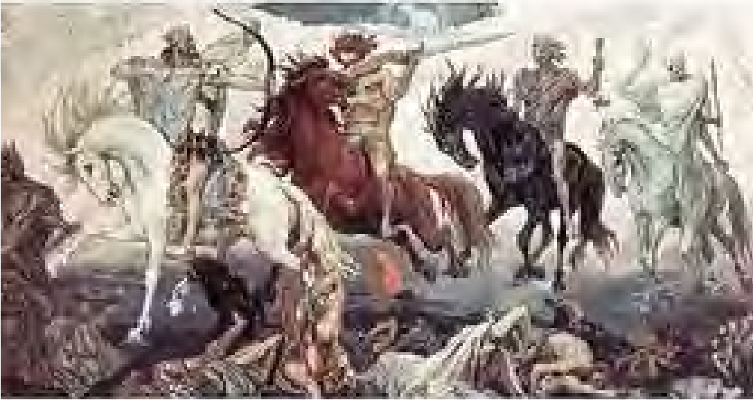
The Four Horseman of the Apocalypse

As a result I have already begun steps to ensure my community would be prepared and organized in the event of any type of emergency.